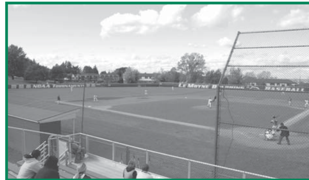
ROCKWELL FIELD HOME OF THE DIVISION I DOLPHINS

The Le Moyne College baseball camp is designed to give the young baseball player an opportunity to develop and improve his baseball skills, while at the same time providing him with an enjoyable week on a college campus. An experienced and enthusiastic coaching staff will teach all of the fundamental skills that are necessary to develop into a better baseball player. Game playing is also an important part of the camp as it will allow the individual to put into play the skills developed throughout the week. While specializing at one position for instruction, games will allow each player the opportunity to work out at other positions. The focus of the camp will be on player development and improvement. No written evaluation is provided.