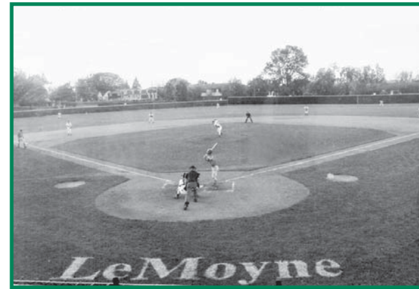
LIVE GAME PLAY

While the Camp being conducted as an educational program is located on the Le Moyne College campus, Le Moyne College is not responsible for operation of the Camp.